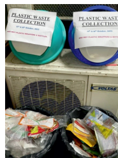
Plastic Waste Management

Nature Nurturers is the junior college nature club. We at Nature Nurturers aim to nurture Mother Earth with all love and care with community participation. The club has been formed with a vision to unite HRites with Nature. Club Nature Nurturers conducts various nature-related fun as well as down-to-earth activities as our duties.