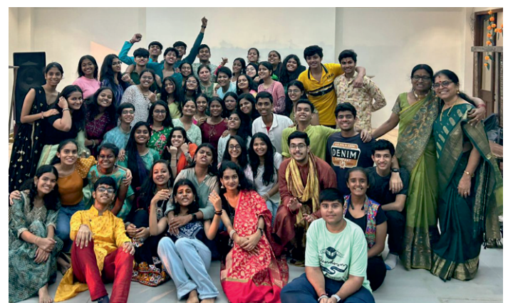
October 20, 2023- Navratri Pooja, an auspicious event

The objective of the attendance committee is to supervise the attendance of students of the Junior College, so that they maintain minimum 75% mandatory attendance throughout the year as required by the HSC Board, in order to appear for the final examinations.