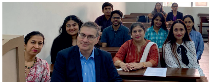
February 21, 2022 - H.R. College X King's College, London

The constant aim is to expand the scope of activities, to further strengthen the culture of internationalization, start on-campus foreign language courses and build relationships with new universities while maintaining existing relationships, for a mutual exchange of ideas, knowledge, and information.