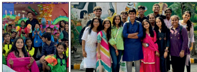
16th December, 2023 3- COLOUR CARNIVAL Bhavishya Yaan Byculla Centre. .

This project was done in 3 phases consisting of blind painting, goal ball and dandiya night respectively. All these activities were done with the blind kids.