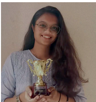
Intercollegiate win - MVM - Hruturang