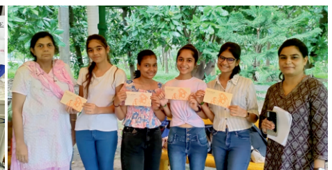
Conserve to Preserve, an event held by the junior college nature club at Sagar Upavan, a botanical garden in Colaba, to connect the students to nature, had enthusiastic FYJC & SYJC student participants.