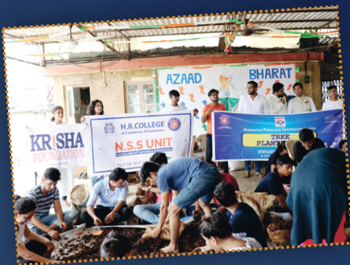
Students prepare seed bombs for the Seed Bombing Project.