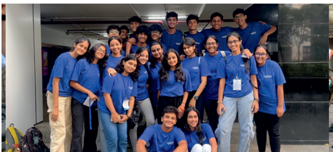
October 10-12, 204 - PEHCHAAN - Atlas Skilltech University This project is done with the KurNiv Foundation where we bridge the gap between the privileged and the unprivileged by living life as them and understanding what goes behind their daily routine. We were basically prepping those kids for college.