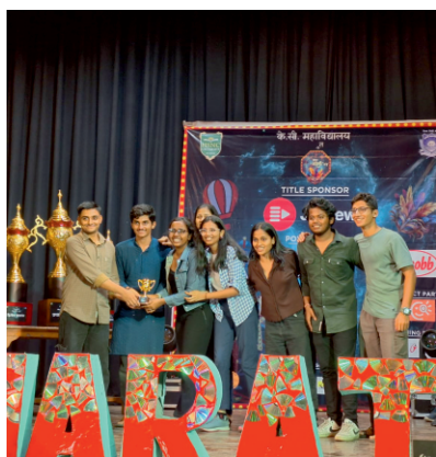
Intercollegiate win - MVM - My Marathi

The objective of the Special Cell is to provide students a support in overcoming dyslexic, learning and other learning deficiencies. The Cell creates a platform for these young adults to prove their mettle and creates a marked difference to their lives.