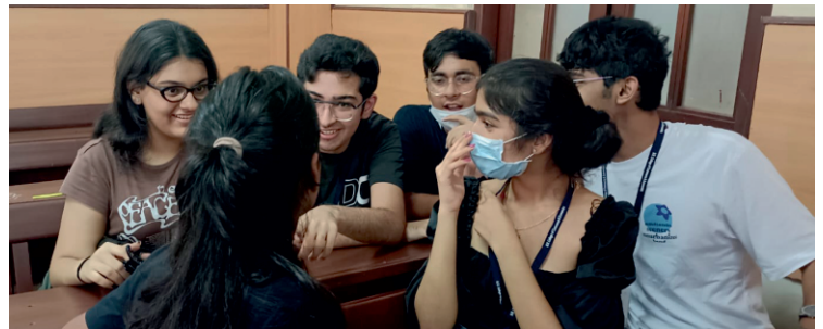
BAMBOOZLED: A themed treasure hunt and quiz