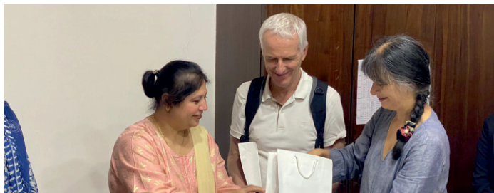
November 3, 2023 - University of Oxford Visit