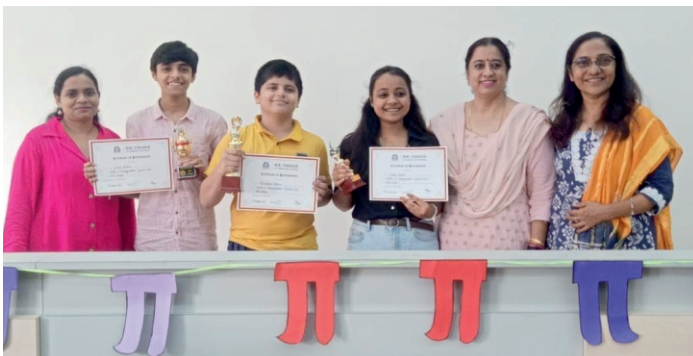
October 12, 2023 - Maths is Everywhere

Mathmatrix an inter-collegiate mathematics competition hosted by R.A. Podar College of Commerce & Economics, consisted of various events where students required unprecedented zeal and mathematical skills in order to win. Students secured first position at R.A. Podar's Mathmatrix 2022.