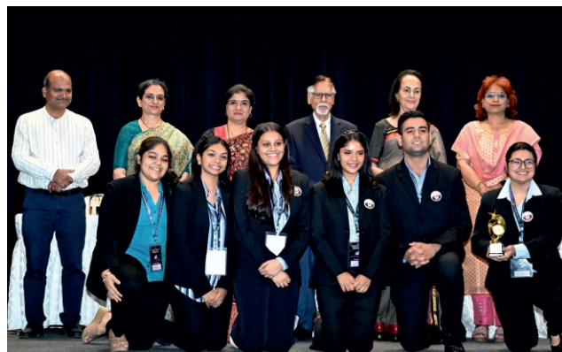
H.R. College won 1st in overall speaker & 2nd in overall question & answer at 31st International Economics Convention held at K.C. College.

The Teaching & Learning Materials Centre (TLMC) is a curriculum laboratory which provides resources aimed at improving the teaching and learning process. The TLMC has activity guides, simulation games, instructors manuals, examination guides, cassettes, slides, curriculum guides, multimedia kits, video discs etc.