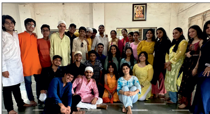
Visit to Swami Shanti Prakash Virdhhashram on 23rd April 2024

The club is a group organized to arrange visits to industrial facilities. The club provides students of HR College with opportunities to gain knowledge about various industries, learn about real-world applications, and interact with professionals in their field of study. The club collaborates with companies and different places to schedule visits, offering participants valuable networking opportunities and experiences.