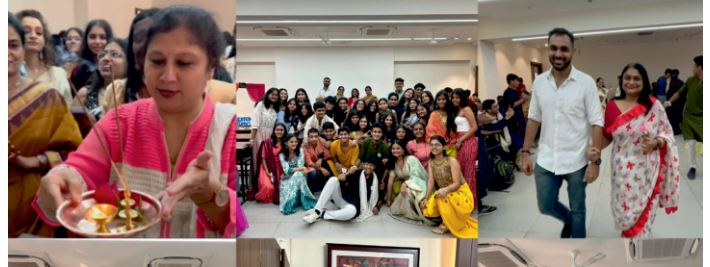
October 16 - 25, 2023 - H.R. Week Traditional Day