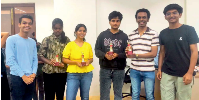
November 9, 2023 - Jeopardy Gameshow

The club aim is to impart knowledge of economics to the students while making them organize events where they learn about their responsibilities towards the club as well as the college. The motto of ECHR is 'making the students New Gen Economists'.