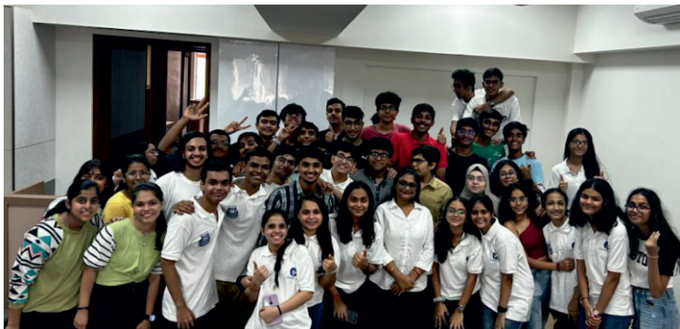
August 4, 2023 - The Comm Trail

The Club aims to develop business acumen among the students who are the budding entrepreneurs of tomorrow by organizing field trips and guest lectures by the experts in the field of business. The Club also organises Business Quiz and Debate on current topics in the field of trade, commerce and International Marketing, thereby, encouraging students to participate in Inter-collegiate business quiz competitions.