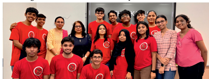
January 11, 2024 - InPursuit

The PSDC is a unique club set up in H.R. College by its students. It provides a platform to its members where the club grants them various opportunities to learn and polish their skills. The club, along with working on upskilling its members in their individual lives, will also equip them with professional skills needed in a "World full of Suits." We believe these skills will be beneficial for our members throughout the course of their lives and careers, and something that conventional academic syllabus does not include.