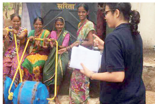
Accessibility to water in rural areas has improved with the introduction of the water wheel

Recently the project was expanded to Shegaon, located at the frontier of Maharashtra. To be able to provide the water wheel at a feasible price, a cross subsidy model was devised by engaging another set of rural women in a revenue-generating process. The profits of which are then used to subsidise the packages.