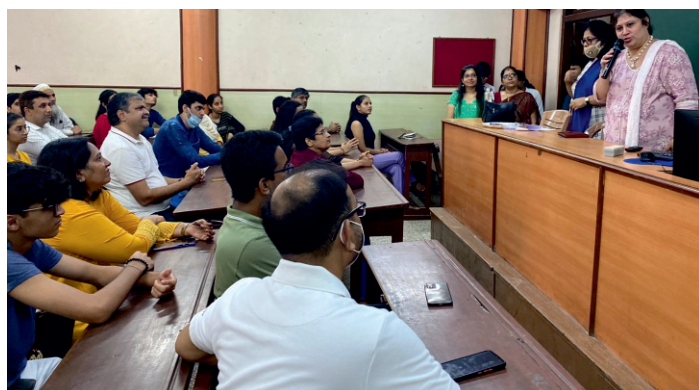
Principal's interaction with parents & rewarding regular attending students