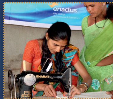
Project Aajeevika capitalises on indigenous skills of the rural women in an attempt to improve their livelihood. The women stitch canvas tote bags which are available in varied trendy designs.