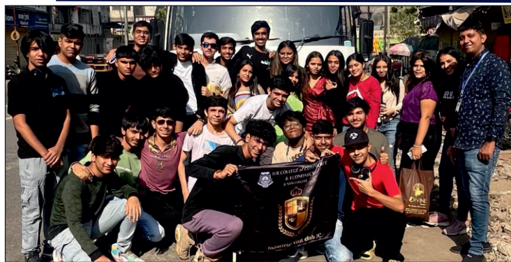
Core Committee with the Teacher - In - Charge at Karjat Staycation