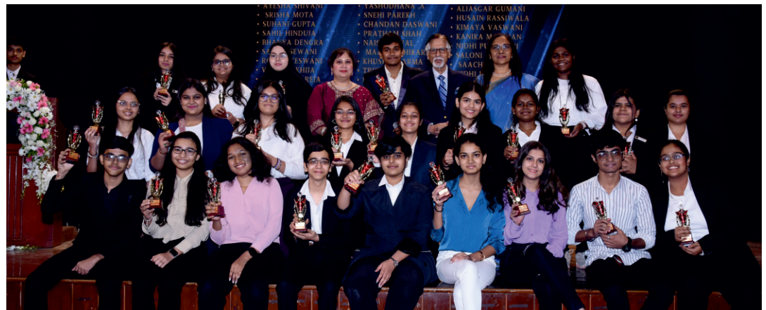
Annual Prize Distribution 2023-2024