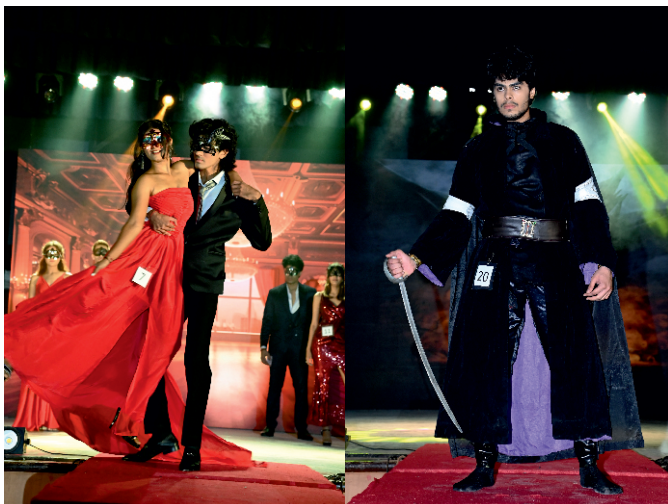
September 9, 2023 - Talent Parade - Fashion Show