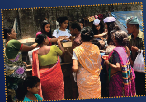
Project LUNCHBOX - millions fed nutritious food at railway stations and in slum areas.