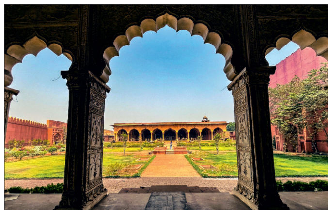
March 21-22, 2024 - Staycation - Trip to Nandi Baag Resort, Karjat