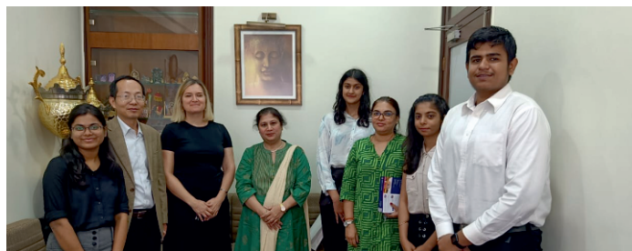
October 20, 2023 - American University of Washington DC