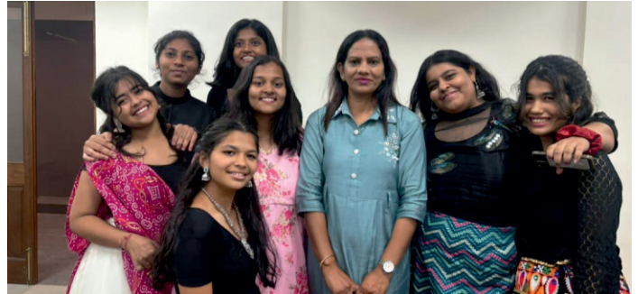
October 26, 2023 - Hasya Kavi Samellan - The event then witnessed marvelous and superb performances consisting of recitation of poems, teacher's participation, group dances and much more.

HSP aims to promote not only our national language Hindi but also Indian ethics, values and culture amongst the students by organising various activities like essay writing competition, debates and cultural events like Independence Day and Guru Purnima etc. It provides a platform for its students to participate and organize events like Essay and Dance Competitions.