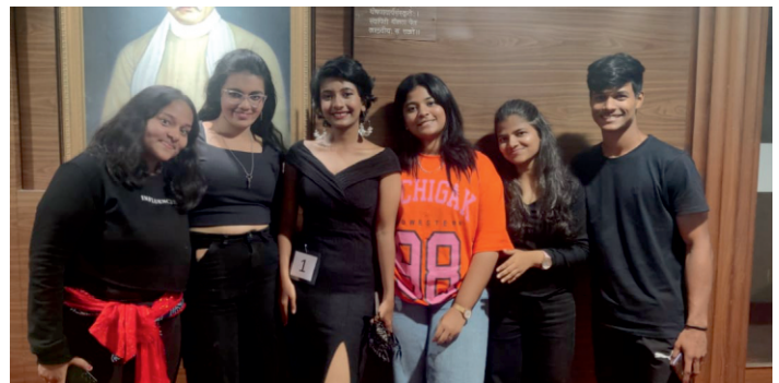
September 9, 2023 - Talent Parade