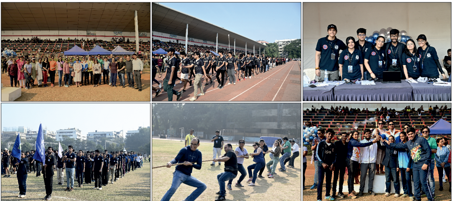
Sports Day 2023 - 2024