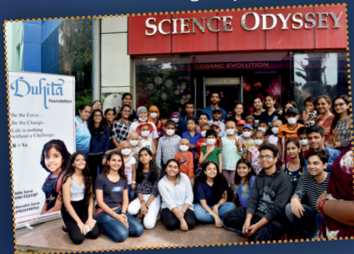
Project Muskaan - bringing a smile to faces of kids fighting cancer.