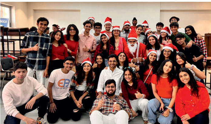
Christmas Party for the students of Foster Care Group, Worli by G.E.M.S.

GEMS Bazaar is an annual event where students put up stalls to develop entrepreneurship skills. CHASE is similar to a treasure hunt. Christmas is celebrated each year with underprivileged members of the society.