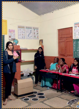
Sanitation - Teaching village women the basics of menstrual hygiene.