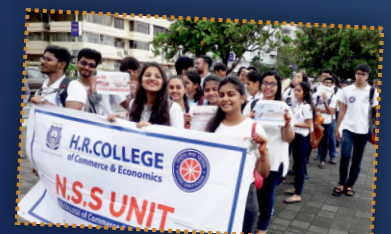
Rally to spread awareness about Organ Donation.