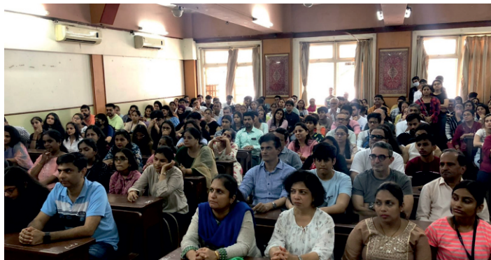
Principal addressing the parents of junior college

The WDC seeks to encourage girl students to work towards their personal and social development. The Cell aims in particular at sensitizing the student community to issues relating to the female gender. The role of the Cell is to equip the students with the requisite awareness and self confidence which in turn would allow them to take their rightful place in the society.