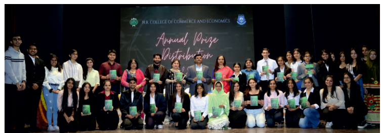
Jubilant students with their copies of the Anthology Volume 2

We believe, that writing comes with a responsibility. Humanity is an essential quality in writers and their content. Wisdom, intelligence, creativity, and humanity go hand-in-hand. While the club facilitates honing and showcasing talent, the qualities are necessarily intrinsic and the club respects these in each writer. The vision of the honourable Management and the Principal for each student's holistic development has given birth to this club, and the club keeps striving to nurture these dreams.