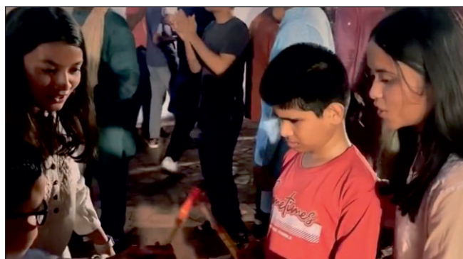
UTSAV October 23, 2024 - Victoria School for the Blind.

The Rotaract Club falls under the Rotaract district 3140 of Mumbai. It has organised over 500 projects during the year like Boond, Gazab Maharashtra etc.