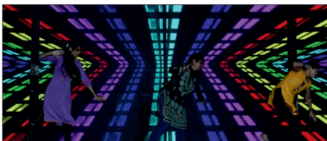
Non-Teaching Staff Dance performance