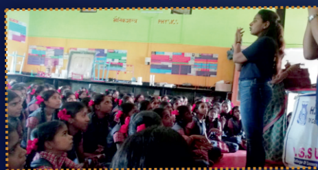
Seminar on Menstrual Hygiene in the municipal school at Gorhe village, Palghar.

10. DEPT OF LIFELONG LEARNING AND EXTENSION