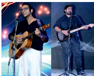
Mesmerizing singing performance