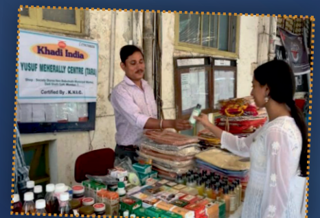
An exhibition-cum-sale held of products manufactured by Yusuf Meherally Centre.