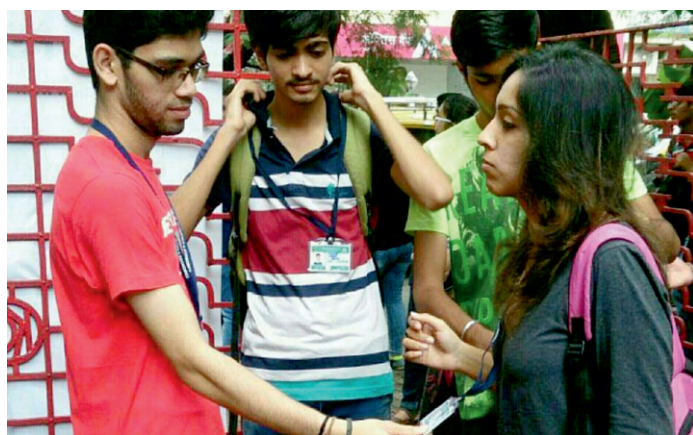
Volunteers check student ID's on the college premises

orientation, appearance, nationality, regional origins, linguistic identity, place of birth, place of residence or economic background.