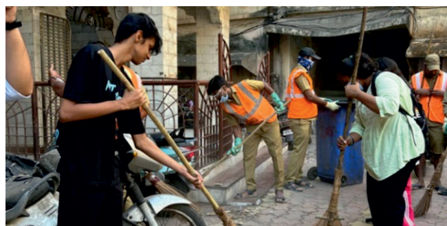
March 1, 2024 - UNSUNG HEROES - This project aims at helping and recognising heroes who work tirelessly for us.