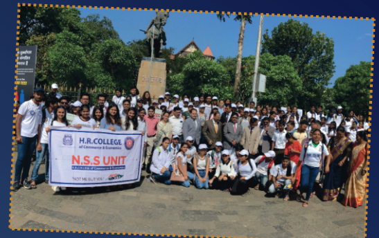
Campaign on Wheels to create awareness of child rights and to reduce child abuse.