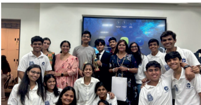
January 23, 2023 - Brand Plus