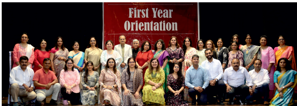
Junior College Faculty

Thus continuous efforts are undertaken by the IQAC to improve the quality of teaching and learning in the college thus