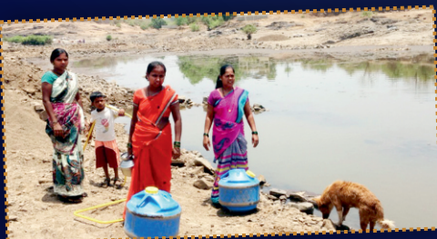
Project Jalvrudhhi - introduction of the water wheel to improve accessibility of water in rural areas