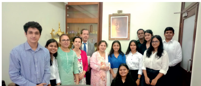
October 12, 2023 - Conference with EDHEC Business School

The college has secured several opportunities for meritorious students to experience alternate learning styles in different cultures and broaden the horizons of their knowledge. Some of the preferred ones are Kedge Business School's Scholarship; Asia Pacific University Japan's Scholarship; Betty and Donald Keating Scholarship to St. Catherine's College, Oxford University, UK; Advance Student Admission Program to the SP Jain Institute for Management and Research, Dubai, UAE; and McDonald Conference for Leaders of Character at the United States Military Academy, WestPoint, USA.