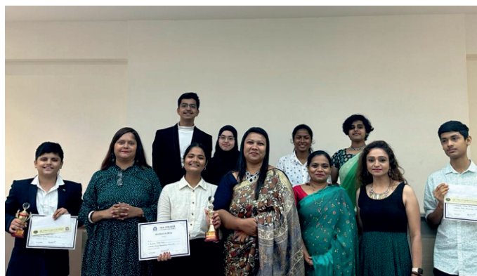
Research Paper Presentation