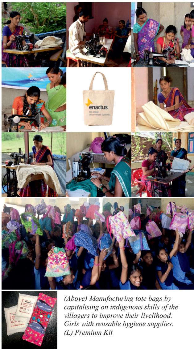
(Above) Manufacturing tote bags by capitalising on indigenous skills of the villagers to improve their livelihood. Girls with reusable hygiene supplies. (L) Premium Kit

their family income and henceforth, enhancing their standard of living. Rural women are empowered to capitalize on their stitching skills. The women possessing stitching skills are identified from rural communities. The women employed are then vocationally trained in being seamstresses. This gives them a skill with which they can earn a livelihood and become independent. Unlike any other competitors, the bags are customizable with zips, chains, and other accessories along with an array of designs at the choice of our consumers. To date, 2,000 bags have been sold under Project Aajeevika