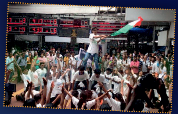
Tryst With Destiny - Flash mob at Railway Station an Independence Day campaign.