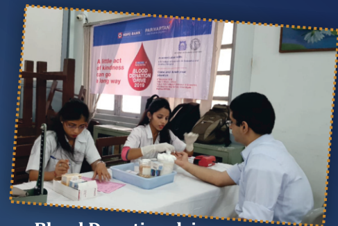
Blood Donation drive at HR College